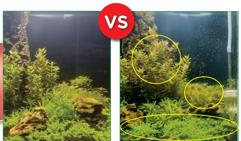
Without Bio-CO 2

WITNESS THE BIO-CO 2 DIFFERENCE IN JUST 25 DAYS!